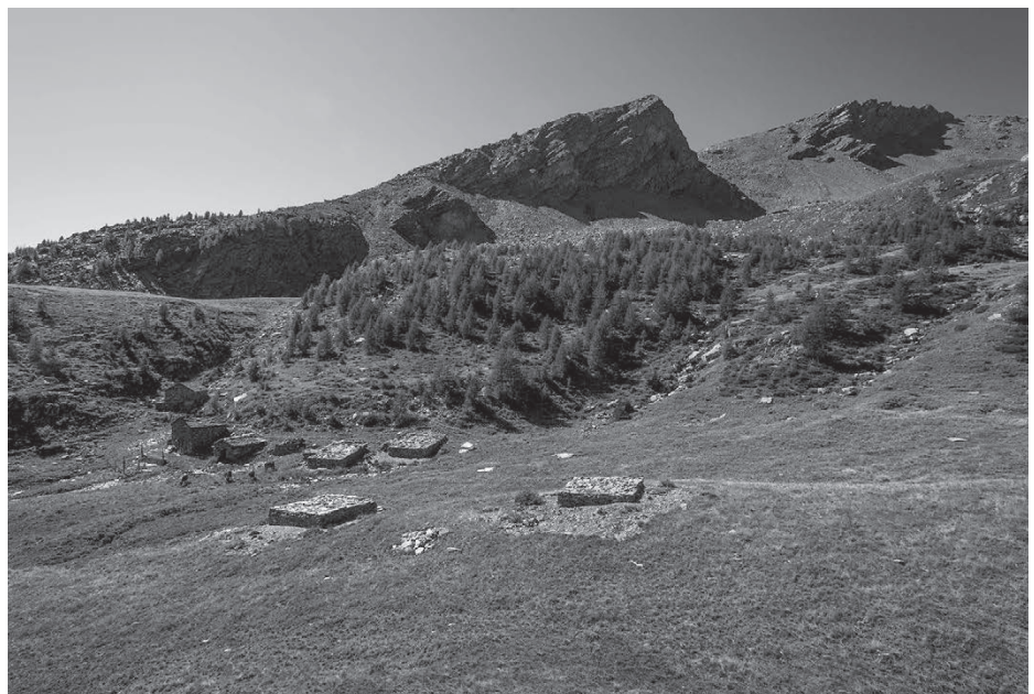
Recompositions on Mount Sceru